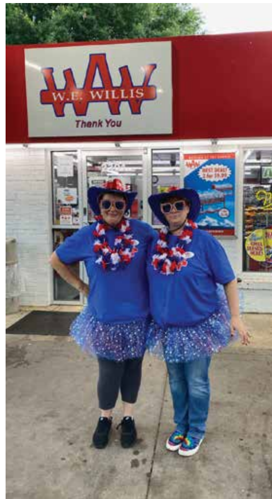
Pictured from Memorial Day 2021.

They are organized too! The dispenser is full and faced, EOG are ready, supply requests ready and the playstation is maintained. They understand the games! They know their customers names, and the games they play! They are competitive! They came oh-so-close to winning a prize in the CASH POP incentive we ran in Jan/Feb of this year. They WANT to be a MILLION DOLLAR RETAILER! YOU can do it!