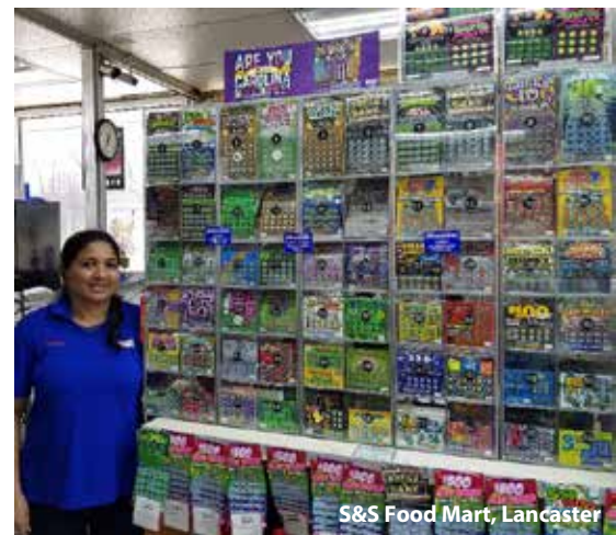
S&S Food Mart, Lancaster