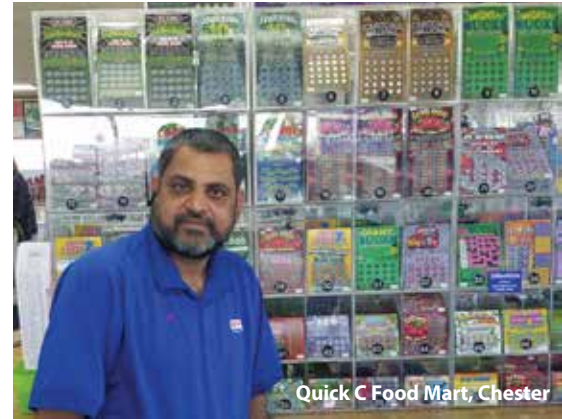
Quick C Food Mart, Chester