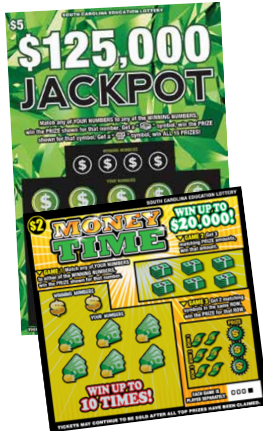
Launch dates and tickets are subject to change. Artwork shown is not necessarily representative of final product.