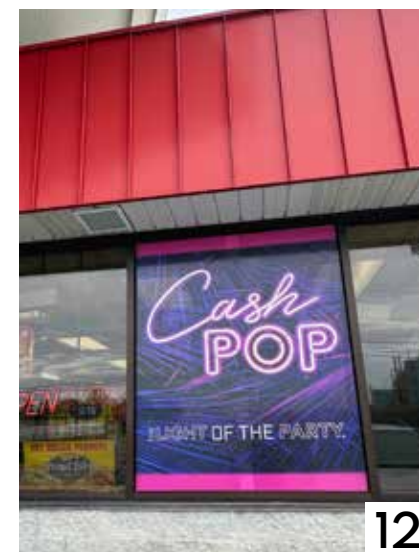
1. Elliott's Exxon in Rock Hill. 2. Bapa's Food Mart in Aiken. 3. Quick Pantry #39 in Gaston. 4. Racers Gas in Gloverville. 5. Garden Spot #4 in Taylors. 6. Save More in Clemson. 7. Leela Food in Piedmont. 8. Quick Pantry in Honea Path. 9. El Cheapo in Columbia. 10. Khodiyar #247628 in Easley. 11. EZ Spot in Columbia. 12. Quick Corner in Columbia.